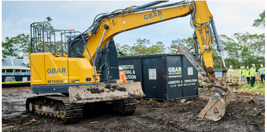
Excavators were used to demolish existing structures on the site

We appreciate your continued support and patience as we work towards completing this project.