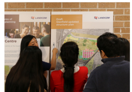
Sharing ideas about the future of Glenfield at the recent community workshops.