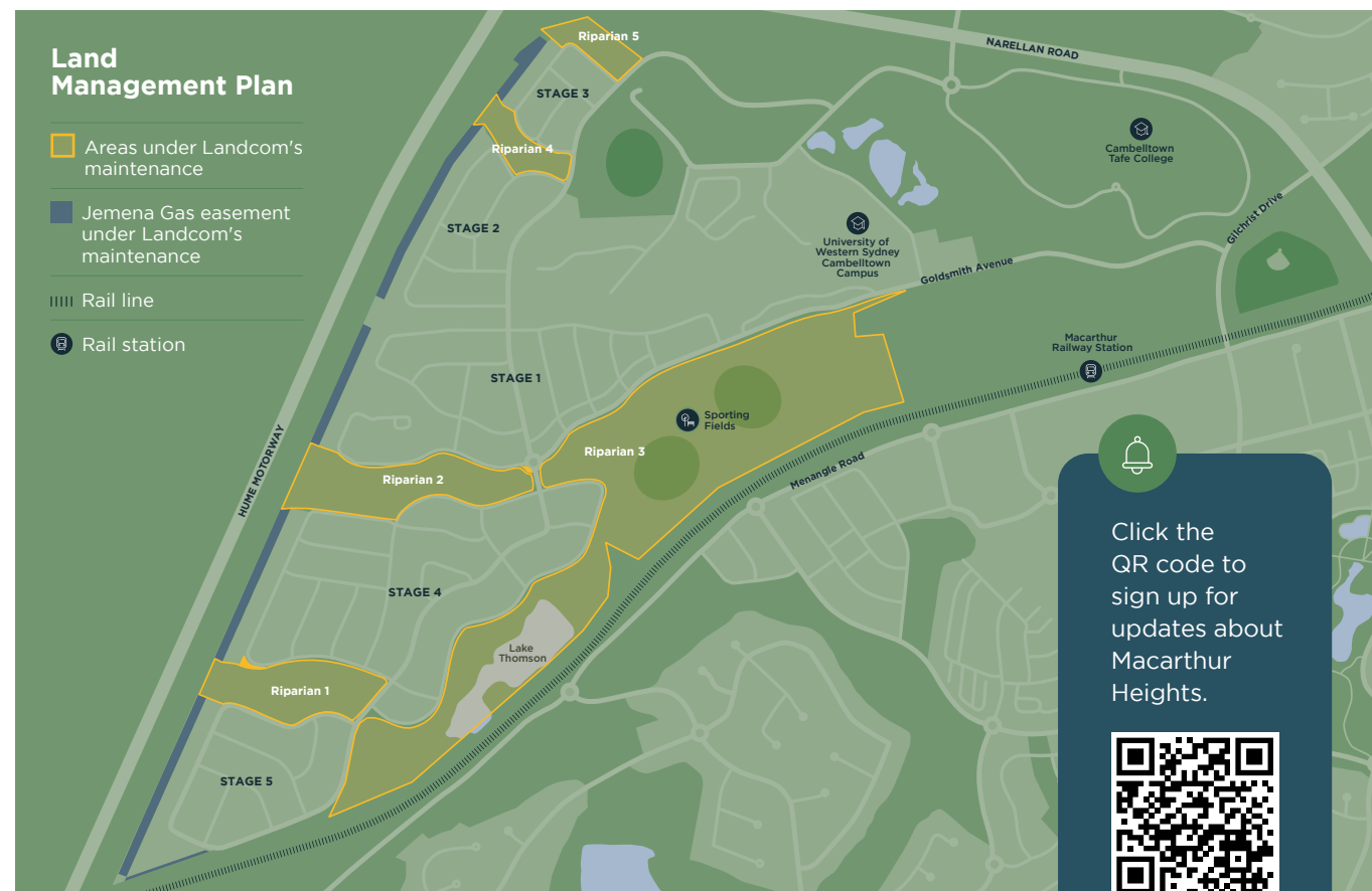
Macarthur Heights Land Management Plan

We know there are ongoing concerns about maintenance across Macarthur Heights. We have worked with Council and Western Sydney University to re-confirm maintenance responsibilities. The map below identifies these responsibilities. Please contact us if you have any maintenance queries.