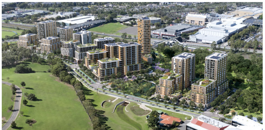
The proposed modified concept masterplan

https://pp.planningportal.nsw.gov.au/ppr/post-exhibition/macarthur-gardens-north .